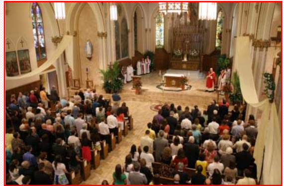
May 23, 2009 Confirmation